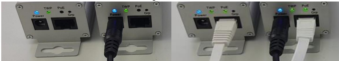
Both devices connected with each other.